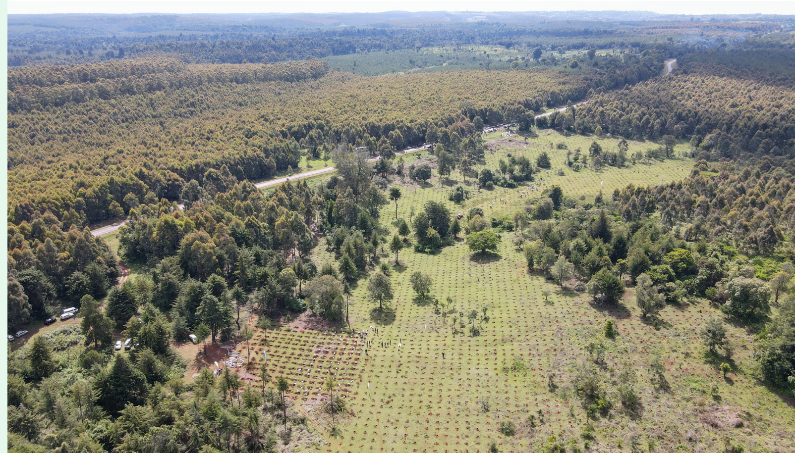
The Kaptagat forest