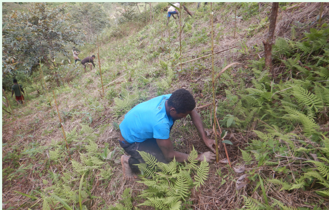
Transplanting saplings.

The target restoration area is a forest corridor known as “Anjanaharibe,” which surrounds a community-managed forest that is within Makira protected area. Support from the ReForest Fund has allowed the project to restore a further 40 hectares of degraded forest within Makira Natural Park. This year, the project has continued the important work of maintaining the areas of the forest that have been restored. A total of 60.3 hectares of degraded forest have been restored since the beginning of the project. And just under 36,000 trees planted over the last six months.