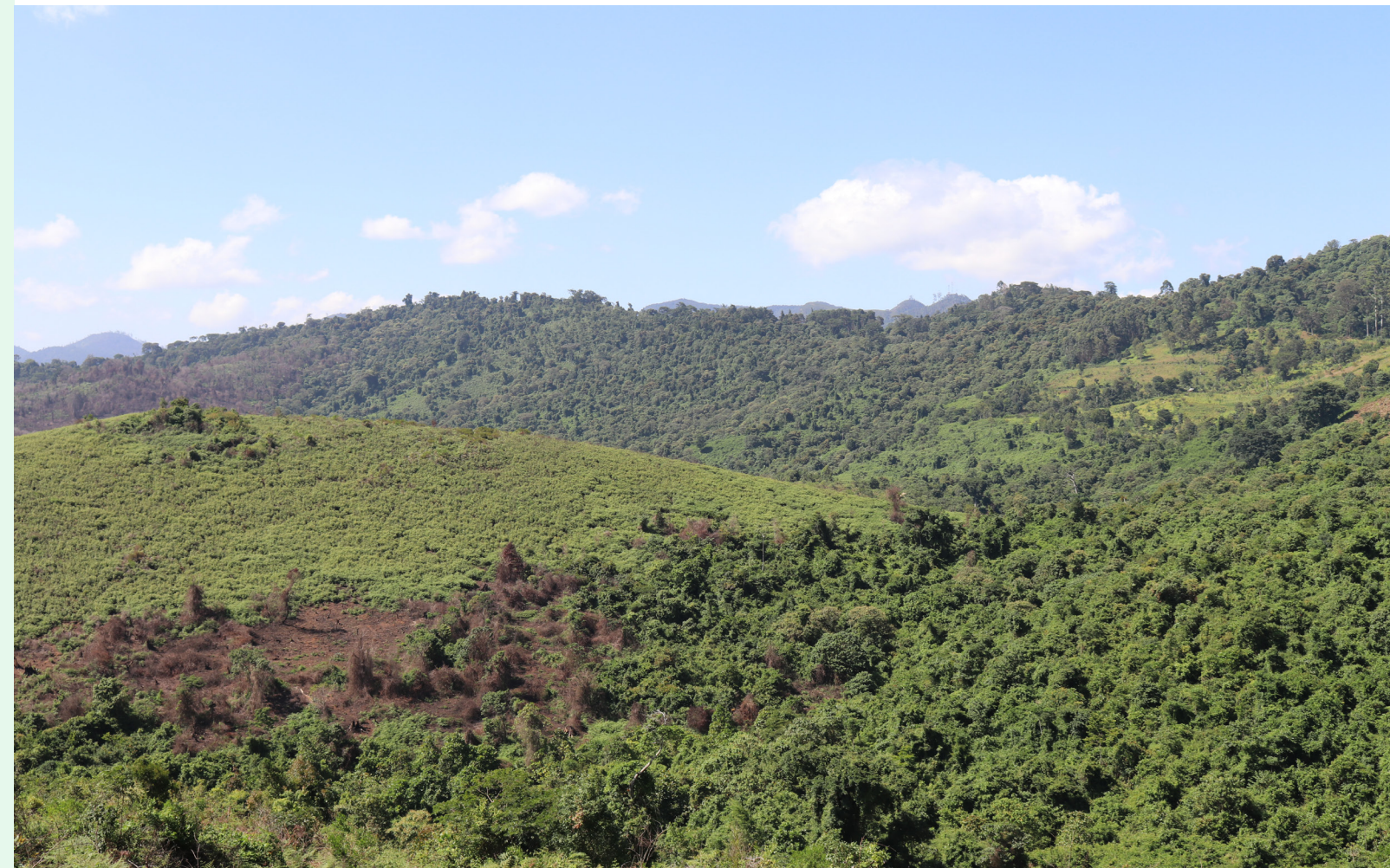
Restoration sites in the Usambara Mountains

Recently the project has been restoring forest patches, particularly in the Mbaramo area, supporting native tree-planting along river catchments to promote habitat connectivity for wildlife and improve water quality and supply to the area. WWF has already supported the Friends of Usambara to carry out restoration activities in the West Usambara Mountains which provides water for the lowlands including Mkomazi National Park and Uмба Steppe.