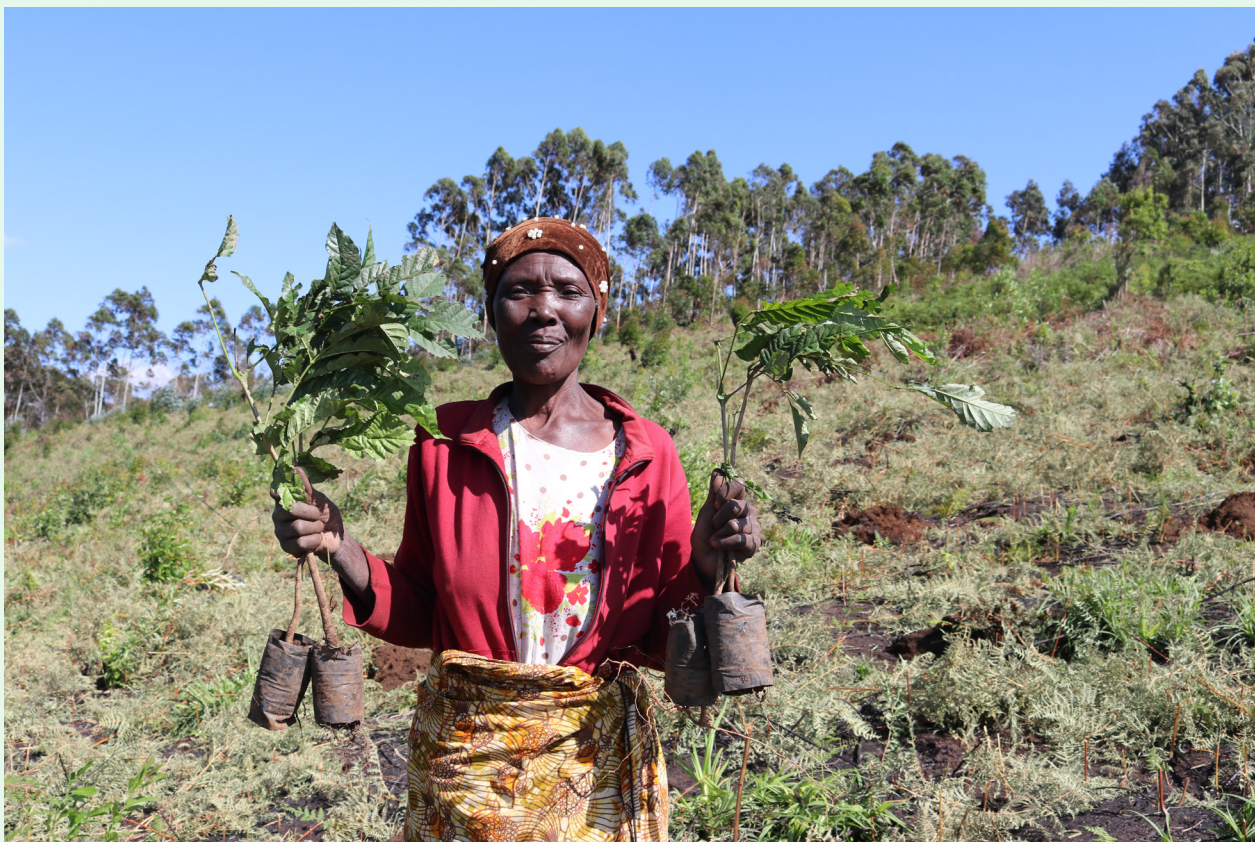
Planting saplings in the Usambara Mountains

The restoration project aims to use innovative and multiple landscape restoration approaches to both enhance the wellbeing of local people and support biodiversity. This approach enables communities to engage in supporting natural regeneration, through the sustainable management of community forests to generate more sustainable sources for fuelwood and livelihoods.