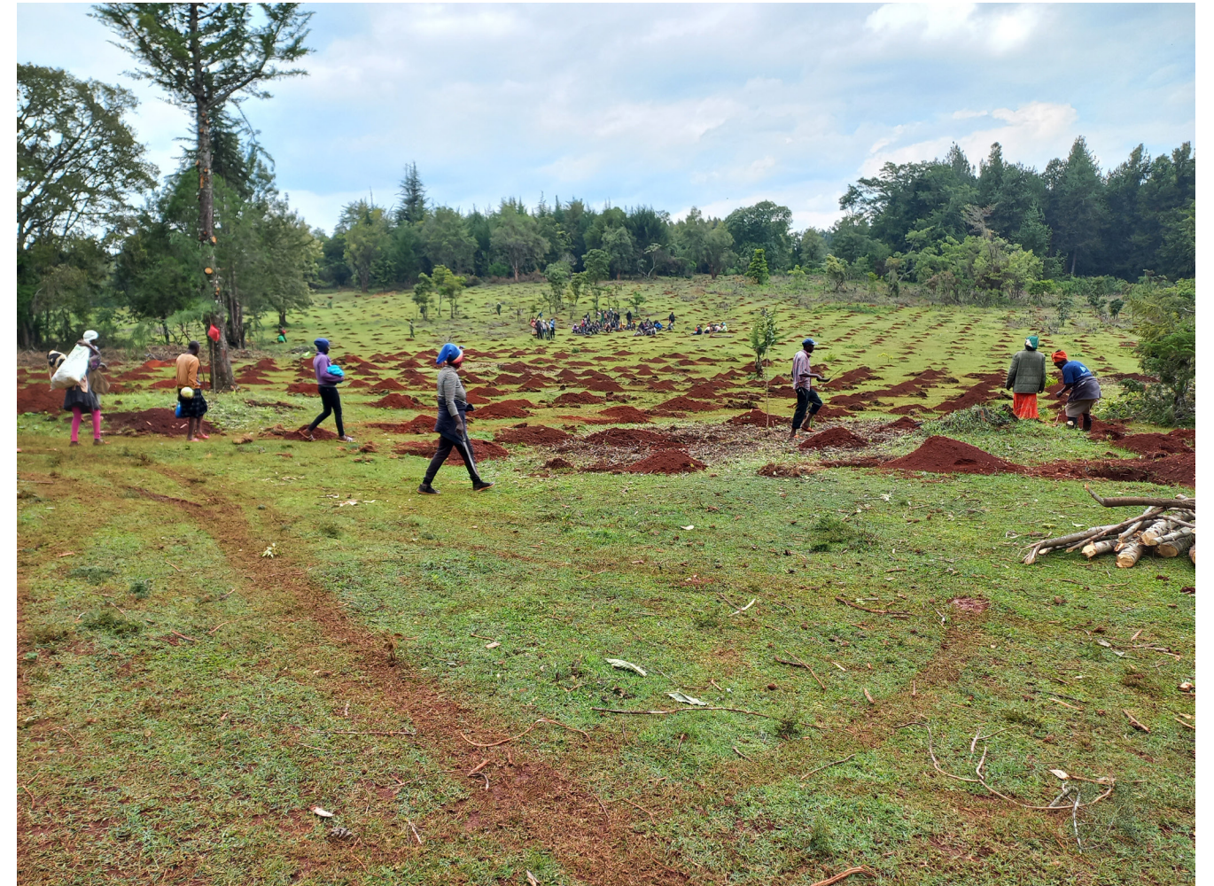
Community members planting seedlings

The project is laying the foundations for work over the coming years that will reduce emissions, contribute to poverty alleviation and address land degradation. So far, a significant start has been made to the project - a perimeter fence has been set up to safeguard the site, restoration work has been initiated including the planting of seedlings from community nurseries, and more than 150 community members have benefitted through being involved in this work. Already they have restored over 50 hectares and now, with support from the ReForest Fund this important work will continue, benefitting local communities, boosting biodiversity and helping in the fight against climate change.