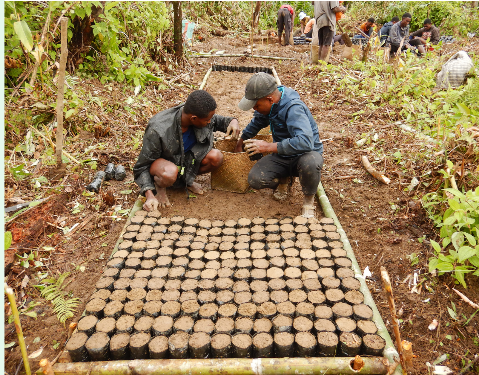
Setting up the nursery.

In addition to supporting ecological forest restoration, the project also works with local farmers to improve farmer livelihoods, aiming to reduce the pressure on forest land. WCS supports farmers to adopt agroforestry techniques and grow cloves and vanilla, which perform well in forest gardens and can attract good prices.